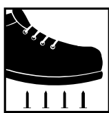
Product features reinforced midsole