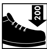
Product features 200J toe cap