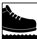
Product features anti-slip sole