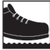
Product features anti-slip sole