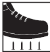
Product features reinforced midsole