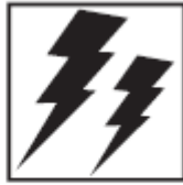
Product features antistatic sole