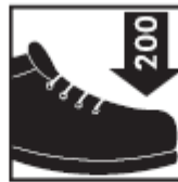
Product features 200J toe cap