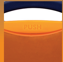
COLOUR CODED CLIP