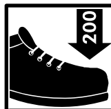
Product features 200J toe cap